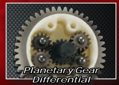
Planetary Gear Differential

The Nitro Magnum 281™ single speed transmission is built Nitro Tough™ with 32 pitch gears, metal top gear, and smooth-running, long-lasting precision ball bearings. This proven, track-tested, three-gear design is built for performance driving applications.