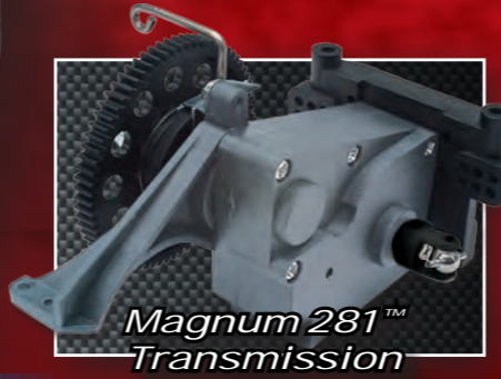
Magnum 281™ Transmission

The Nitro Magnum 281™ single speed transmission is built Nitro Tough™ with 32 pitch gears, metal top gear, and smooth-running, long-lasting precision ball bearings. This proven, track-tested, three-gear design is built for performance driving applications.