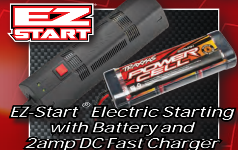
EZ-Start® Electric Starting with Battery and 2amp DC Fast Charger

The award-winning TRX® 3.3 Racing Engine is famous for its broad, linear output that makes Extreme Horsepower available practically anywhere in the rpm range. Hammer the throttle at any speed and Nitro Slash completely shreds the ground underneath. Brutal bottom-end torque punches hard out of the turns, and then screams to top speeds soaring past 50mph! The extra-large dual-stage Traxxas air filter allows increased air flow to the TRX 3.3 Racing Engine, breathing in even more horsepower and torque.